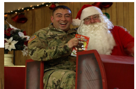
Hey, You are never too old for Santa!