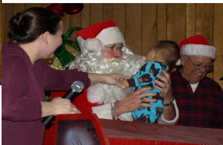
Visits with Santa & his Elf!