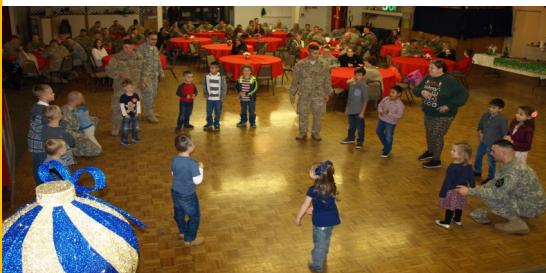
Everyone loves a good Hokey-Pokey!