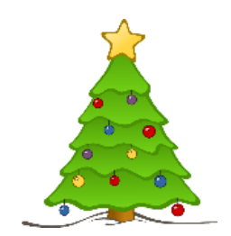
Christmas in November

We will not have a Christmas tree in the canteen this year...I know it is sad, but the principle is still the same. We need items for our veterans and their families in need.